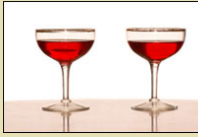
Schachnovelle Grossdruck 1